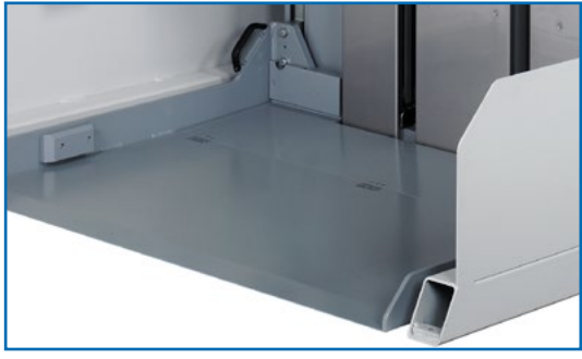
Pressure control flaps within the platform